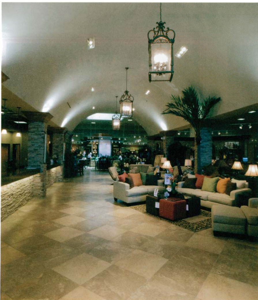
Hodgdon Group provides a diverse selection of real estate services, including construction management

In addition, "I have a Ph.D. in psychology and I teach," he says.